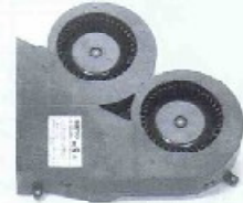
Fully customized product example 3