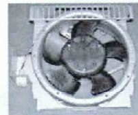
Fan unit example