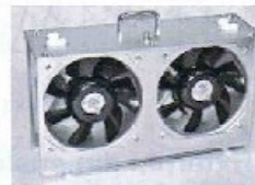
Fan tray unit example 2