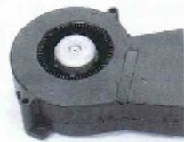
Fully customized product example 1

Fully customized products will be manufactured to optimally match your equipment for high volume needs. (more than 10,000 units/month) for home appliances such as refrigerators, air conditioners and washing machines and for industrial machinery and information communication equipment, including open showcases, power sources and computer-related equipment. Please contact Japan Servo for more information.