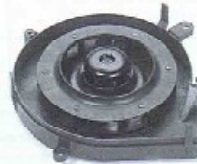
Fully customized product example 2